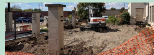
(Right) The new courtyard construction began in 2022.

The Courtyard was funded by the Pittsburg Public Library Foundation. Outdoor furniture was purchased through a grant from the Leon V. & Dorothy M. Skubitz Foundation.