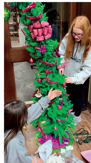
(Right) VolunTeens help decorate the library's Holiday Literary Trees. The themed trees have become an annual tradition attracting hundreds of visitors to the library.