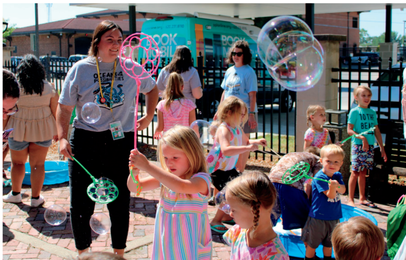
Kids and staff made giant bubbles on the courtyard during story time.

Story times are offered three times a week and are a beloved tradition at the library.