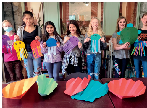
In the spring, teen volunteers created sea life decorations to hang around the library in anticipation of the Summer Reading Program theme, Oceans of Possibilities .

“ VolunTeens is such a cool group! I wish they had this when I was in school. Those kids are growing up to be lifetime volunteers and readers. —Logan Wright